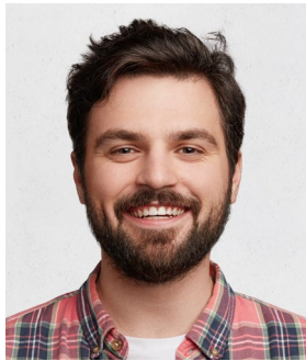
Photo is clear and in color, reproduces skin tones accurately, and is properly exposed with no shadows.