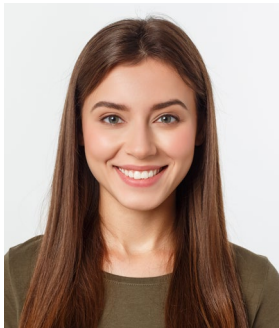
The head is centered and the correct size.