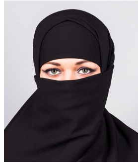
Head clothing covers part of the face.