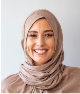
Subject's full face is visible, no shadows or clothing obscure the face.