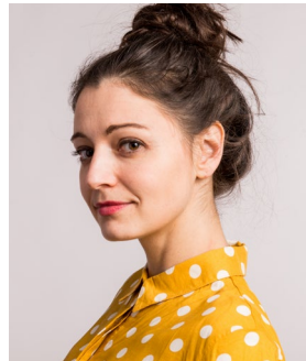
Head is rotated, shoulders are not square to the camera.