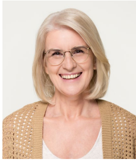
Subject's glasses are free from reflection or glare and frames do not cover eyes.