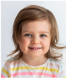
No other person is in the photo and the child is facing the camera with her eyes open.