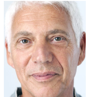
Camera is too close to subject.