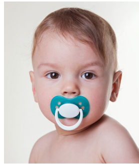
Pacifier covers part of face.