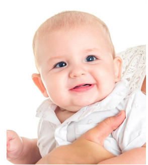
The photo contains more than one person.