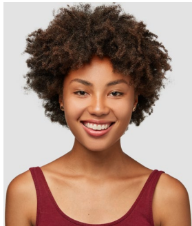
Background is uniform, plain and white or off-white and free of shadows.