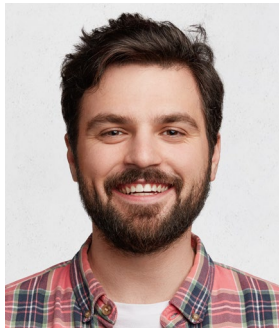
Photo is clear and in color, reproduces skin tones accurately, and is properly exposed with no shadows.