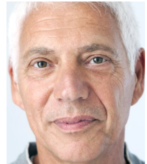
Camera is too close to subject.