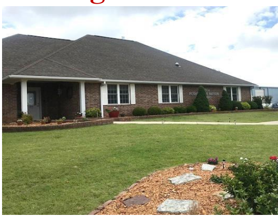
CPN Housing Headquarters